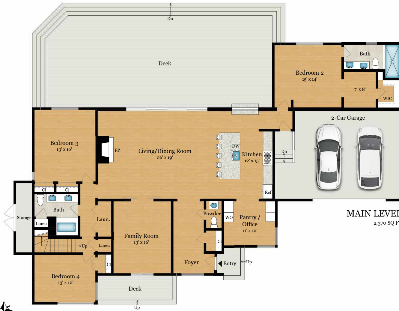
MAIN LEVEL 2,370 SQ FT